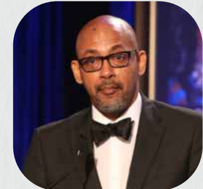
Mr Herbert Samuel