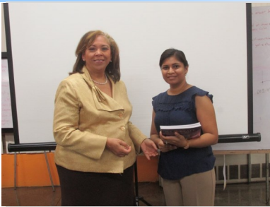
Ms Mohammed of SEPOS & PD

We were very pleased to take our movie, Sun, Sea and Science on the road to several secondary schools in Trinidad over the past few months.